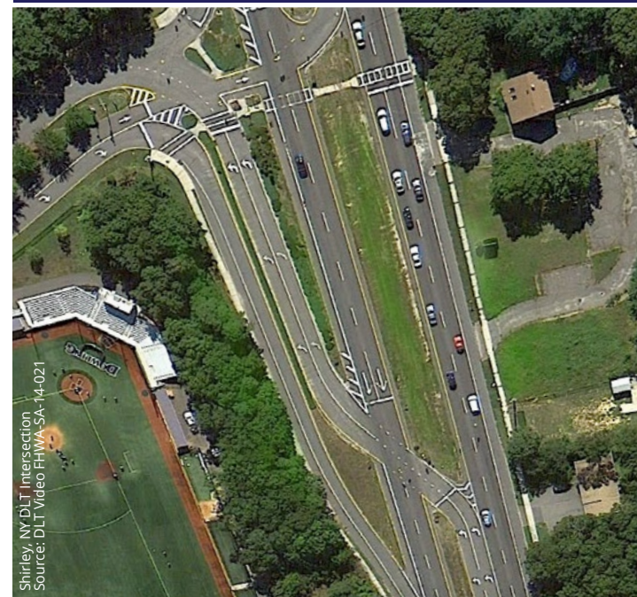
Shirley, NY DLT Intersection

AN INNOVATIVE, PROVEN SOLUTION FOR IMPROVING SAFETY AND MOBILITY AT SIGNALIZED INTERSECTIONS