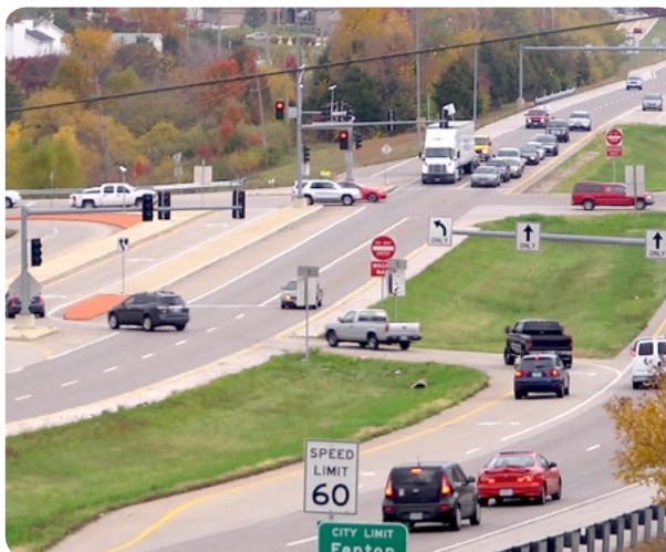
Fenton, MO DLT Intersection