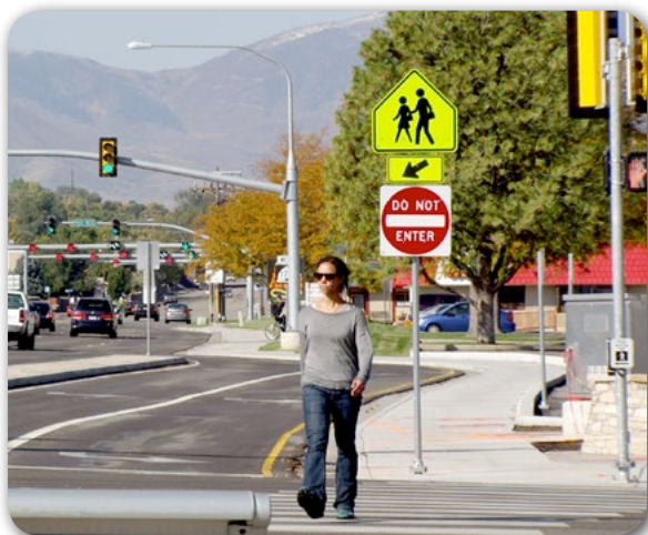
Salt Lake City, UT DLT Intersection

A DLT also can support community goals for pedestrians and bicycles. Provisions for walking and biking must be considered throughout the project development process, with the needs of pedestrians and bicycles shaping the overall design of the DLT accordingly. This includes pedestrian crossings that are accessible to all users, and traffic signal phases that accommodate both pedestrians and bicycles.